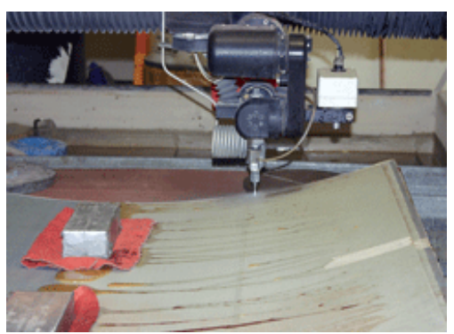
A 3D machine path is controlled dynamically to account for the non-rigid behavior of the waterjet cutting stream.

Waterjet cutting of advanced composite materials poses many challenges for the waterjet process. Advanced composites are typically materials with high modulus (stiffness) and moderate to high strength in the direction of the reinforcement (fibers). Common composites are typically those with graphite fiber that are consolidated as a laminate or woven structure. Those that are laminate, possess extremely low interlaminar shear and through thickness tensile strength. This low strength can create difficulties when attempting to pierce or rapid cut a composite with the waterjet process, cautions Calder.