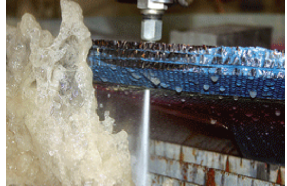
The key to successfully waterjetting composites is to understand the material's mechanical properties and to understand the dynamics of the cutting stream.

Waterjet machining complex 3D surfaces with controlled stand-off (distance from nozzle to workpiece) is becoming a commonplace activity. Advances in 3-axis "Look-Ahead" positional control combined with the latest in CAD/ CAM technology allows for precise cutting of non-flat components. AWC has developed this capability by writing CAM-based post processors and algorithms to complement the dynamic control software manufactured by Omax Corp. (Kent, WA). This complementary software approach combined with 3-axis (X, Y, Z) simultaneous control allows for quick setup and fast run times for waterjet cutting of complex geometries.