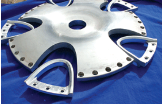
Abrasive Waterjet & CNC is pushing waterjet technology into areas previously reserved for more traditional precision machine tools.